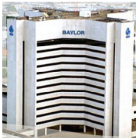
Baylor Hospital Dallas, TX

HOME ABOUT US SOLUTIONS PRODUCTS SERVICES BENCHMARKS MEDIA CENTER CAREERS