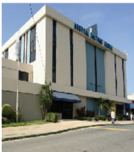
Doctor's Center Hospital Manati, Puerto Rico