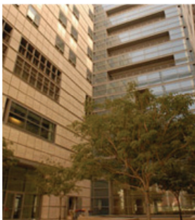
UCLA Medical Center Los Angeles, CA

Thank you. Your e-mail has been verified.